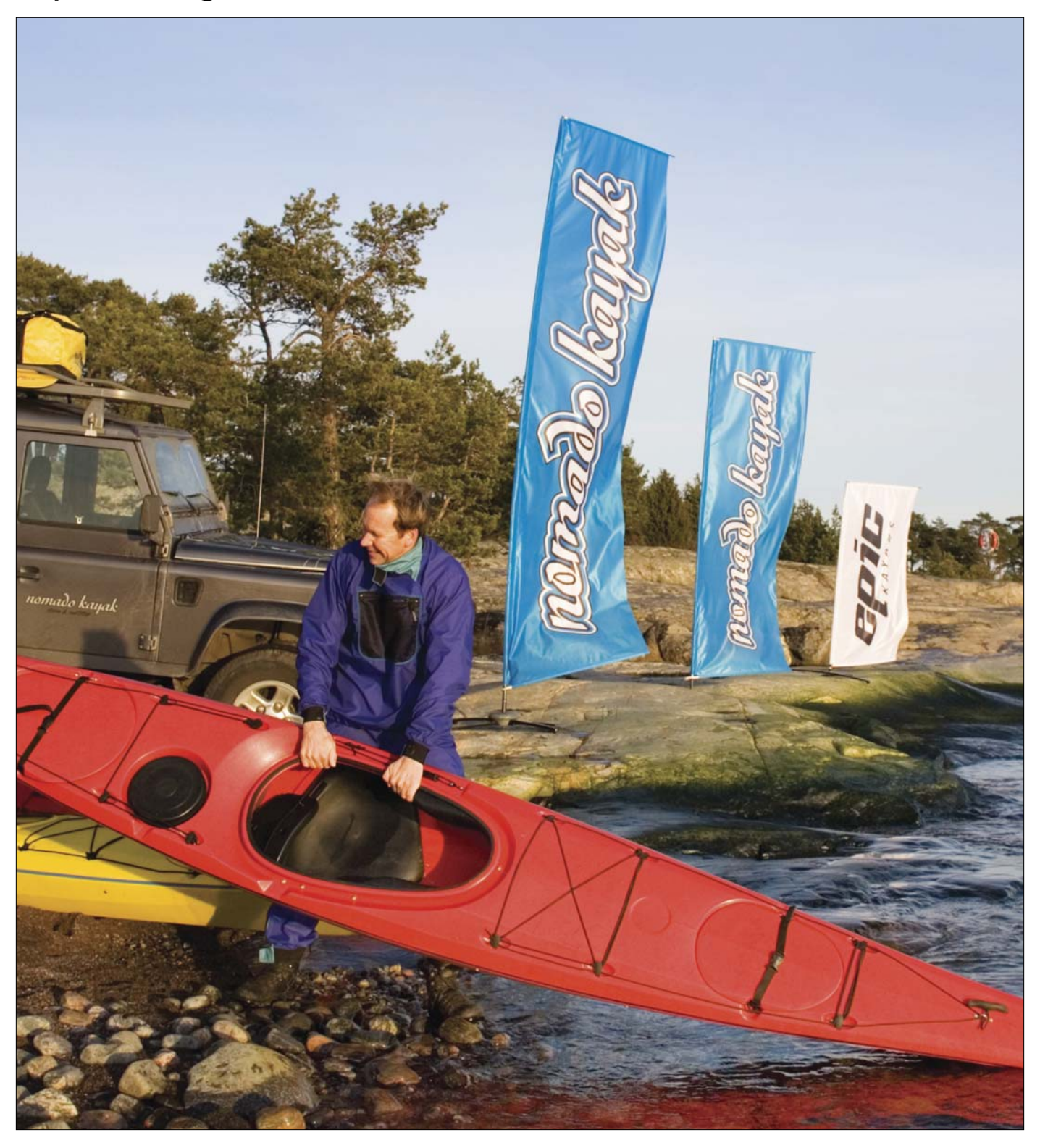
Bring your message to your target audience.