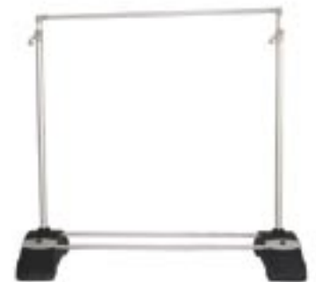
Adjustable Size Frame